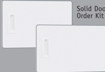
Solid Doors, Order Kit #4396720

New Dual Torx® Security Bolt and Pin Combination secures your investment by prohibiting the separation of dryers.